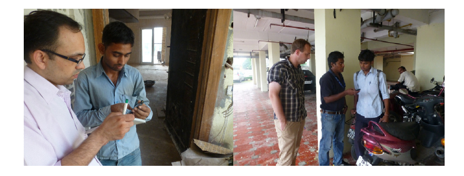
Figure 2 : Researchers demonstrating the visual conversational interface to subjects from target population.