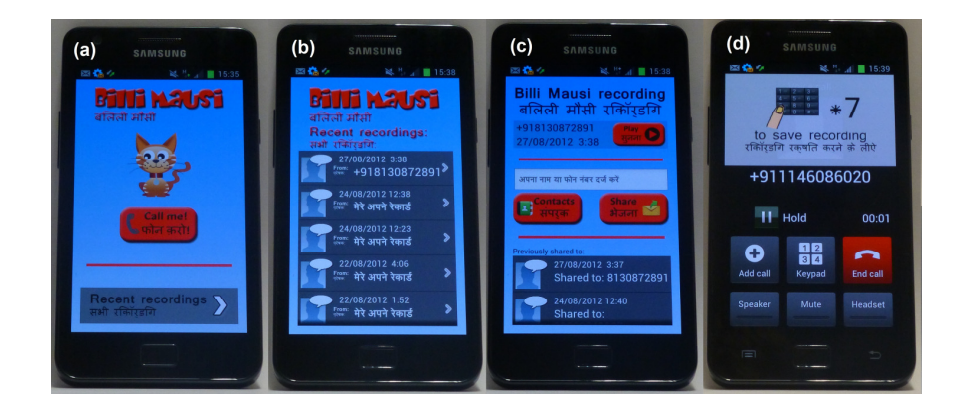
Figure 1 : Screenshots of the Android application: a) home screen, b) list of recordings, c) single recording selected, d) screen during the phone call.

To access a link, a feature phone user needs to dial the phone number embedded in the link and enter a numeric code (also embedded in the link) when prompted. When using the smartphone application the process is seamless and it requires only a tap from the user to access the link. On link access, the voice application fetches and plays the corresponding content and continues with the regular voice application interaction (i.e., the caller can record and share more such recordings).